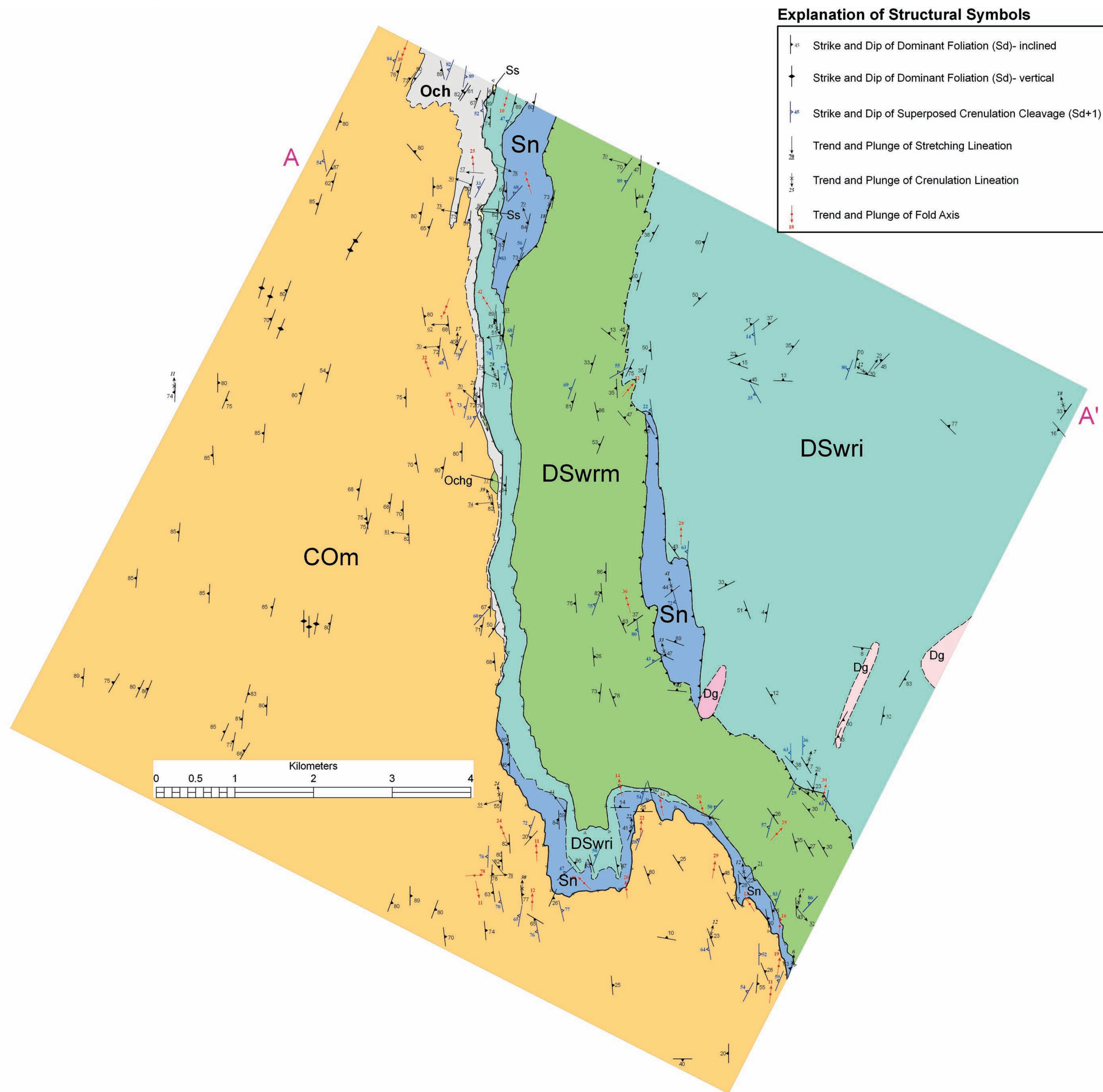
Figure 1- All Structural Symbols on Geologic Base Map